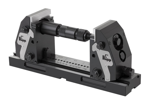
Tractive force 5-axis clamping system compact