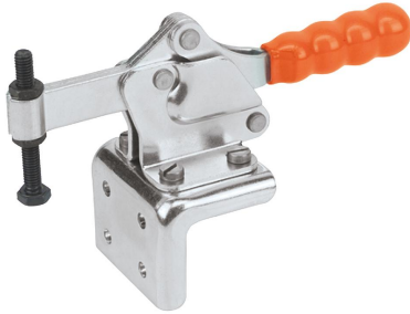
Angle bracket for front face mounting (see accessories)