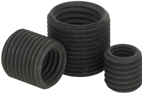
Assembly instructions for locating and threaded bushes