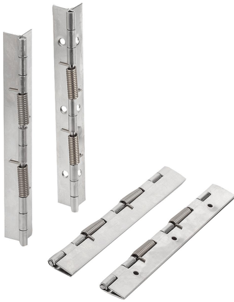
Hinges with closing spring