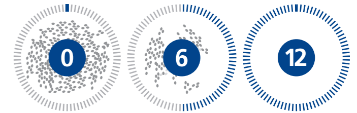
Bacterial break-down within 12 h.